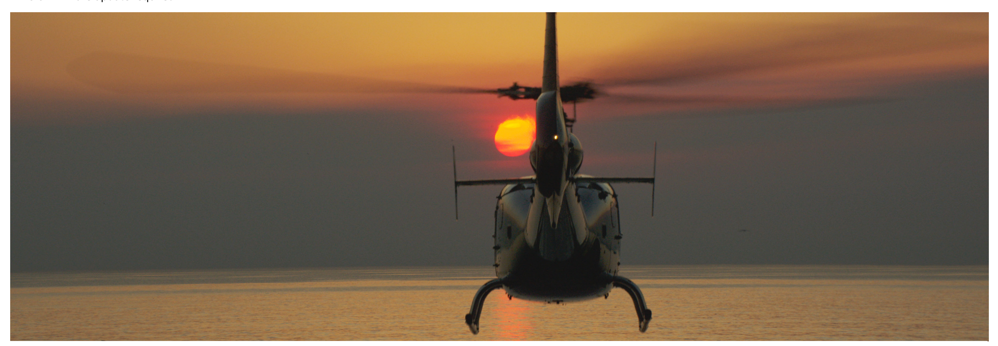
Shot in anamorphic on VENICE in Dual ISO 2500 by Bertone Visuals and Pursuit Aviation.